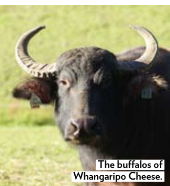
The buffalos of Whangaripo Cheese.

7 Imagine the wind in your hair, salt air on your lips and galloping (or in our case trotting slowly) down a pristine, white sand beach. Sounds like the definition of bliss? That's exactly what Pakiri Beach Horse Rides is. Their one or two-hour rides make for a perfect Sunday morning escape, and the guides are complete professionals. Having ridden a horse only twice in the past 10 years, it was surprisingly easy to pick up and the ride takes you along the picturesque sand beach before winding up into giant sand dunes. The well-cut trails through the forest behind the dunes are fun and even a little challenging and it's easy to see why one travel tome named this one of the top 100 things to do before you die. Bookings are essential. Phone (09) 422 6275 or go to www.horseride-nz.co.nz .