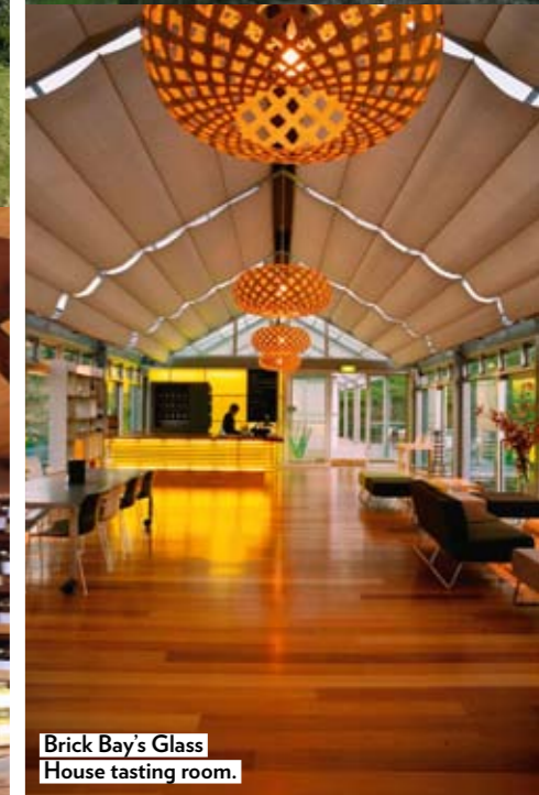
Brick Bay's Glass House tasting room.

creation of the incredible sculpture trail on their property that has proved truly visionary. The easy 2km trail takes an hour to walk and guests can take their wine glasses from the Glass House tasting room as they meander through the stunning outdoor gallery.