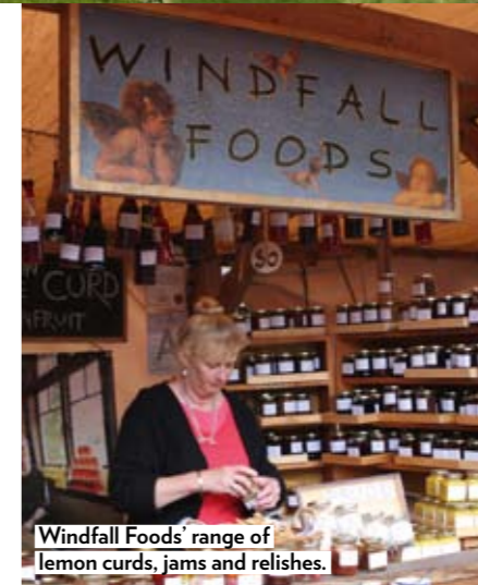
Windfall Foods' range of lemon curds, jams and relishes.