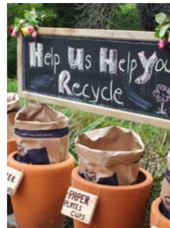
The Matakana Farmers Market is sustainable and eco-friendly.

The trail costs $10 to walk and proceeds go to help upkeep the trail and foster the trust. We love it so much we've invited all of our friends for a midsummer afternoon's wander. For more information, phone (09) 425 4690 or go to www.brickbaysculpture.co.nz .