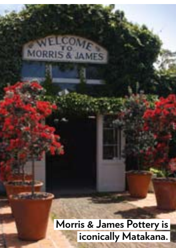
Morris & James Pottery is iconically Matakana.

6 If Matakana is boutique, the cinemas are at the heart of its chic revolution. Their second-to-none artistic interiors have even seen them featured in international style bible Vogue Travel + Entertaining . Each of the three cinemas is individually dressed – the most stunning being the roof of the second cinema which is filled with silk flowers. The functioning theatres screen the latest releases, which you can enjoy with a drop of local wine and an ice cream. After the movie, head next door to wine bar The Vintry, which showcases all of the best wines from the Matakana coast area alongside a selection of Spanish tapas. Go to www.matakanacinemas.co.nz or www.thevintry.co.nz .