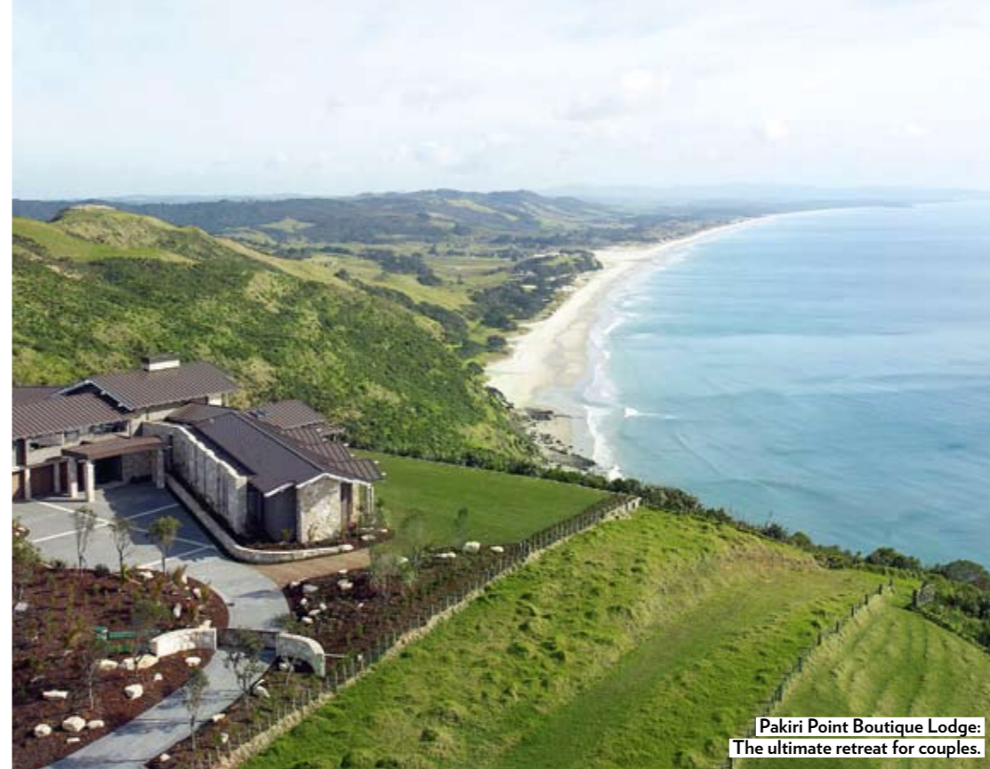
Pakiri Point Boutique Lodge: The ultimate retreat for couples.

3 One of the fastest growing wine regions in New Zealand, this area specialises in small boutique wineries, which makes a Saturday afternoon wine tasting trail a must-do. Signature drops of the region include pinot gris and its Bordeaux-style blended reds, featuring combinations of merlot, malbec, cab sav and cab franc. A glass (or two) of pinot gris in Brick Bay's iconic Glass House tasting room, created by award-winning