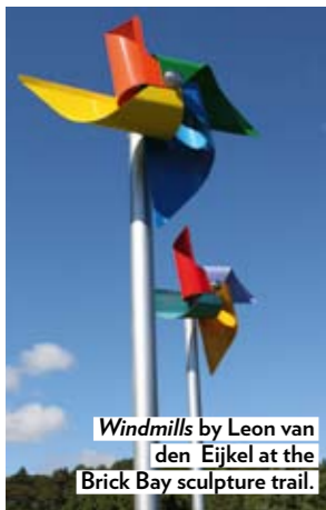
Windmills by Leon van den Eijkel at the Brick Bay sculpture trail.

At this window-to-the-world property, sunrise and sunset are a must-see. The ultimate romantic couple's weekend. For more information, go to www.pakiripoint.com .